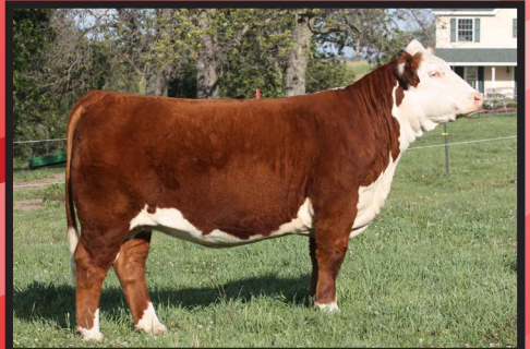
Lot 8 - $5,250 Consignor: Wildcat Cattle Co Sold to: Kent Ganske