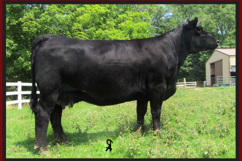
Lot 43, Pregnancy - $4,000 Consignor: Graber Simmentals Sold to: Loren Travernicht

Lot 18 - $4,900 Consignor: Lone Willow Acres Sold to: Al Bruhns Farm