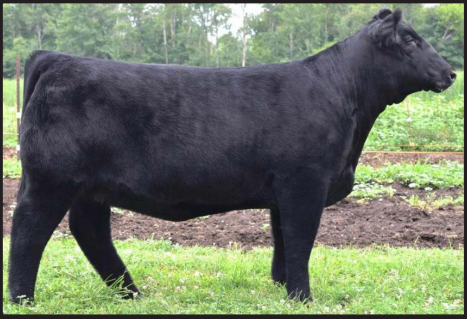
Lot 44 - $5,000 Consignor: Fish Show Cattle Sold to: Breezeway Simmentals