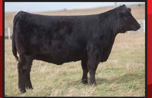
Lot 42, Flush/Embryos - $6,000 Consignor: Graber/Buehler/Storey Sold to: Dennis Larson