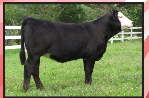
Lot 32A - 5,250 Consignor: AKA Livestock Sold to: Logan Takes