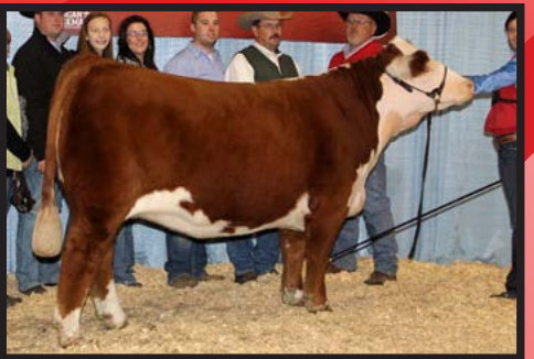
Lot 7, Pregnancy - $5,000 Consignor: Bill Graber Sold to: Lamb Bros