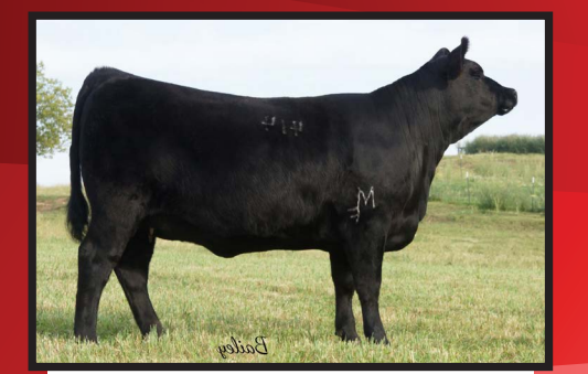
Lot 17 - $7,750 Consignor: Marda Angus Sold to: Premier Angus