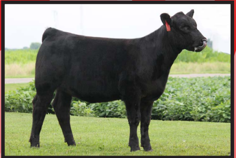
Lot 47 - $5,000 Consignor: Boitnott Family Cattle Sold to: Melissa Morsch