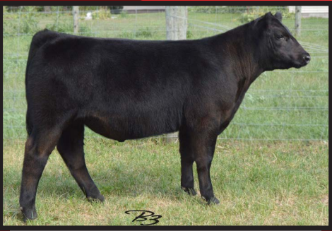
Lot 26 - $5,250 Consignor: Weigel Steer Pit Sold to: Bill Widerman