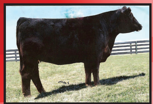
Lot 68, Embryos - $6,800 Consignor: McElroy Simmental Farms Sold to: B. Hanewich, Lemenager & J. Penzenspadler