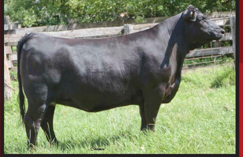
Lot 4 - $8,000 Consignor: James Burns & Sons Farms Sold to: Vintage Angus Ranch